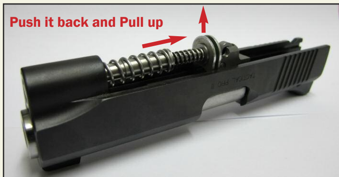
Table of Spring Forces Combination The Springs are Numbered by Length

6. For easier uninstallation of the DPM System no tool is recommended, only follow the below Figure.